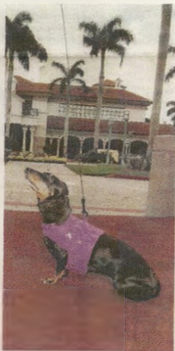
Mia on the red carpet at Dog Days of Summer.