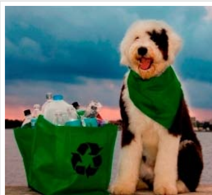
2009 contest winner Dudley goes gorgeously green

Calling all Orlando pups, get your picture on a calendar while helping save the planet .