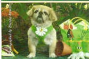
Gamt a Pekingese from Tampa.