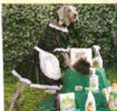
Yanna a Weimaraner from Dunedin. Georgia, a Bulldog from Lutz.

Contestants were also able to upload their images online. Bailey was a Tampa Bay contestant, adopted from the Humane Society of Tampa Bay. Even though she was not one of the finalists she is a winner in our eyes. Always.