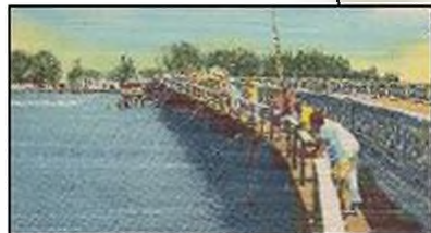
Residents and visitors line the bridge at John's Pass to try their luck fishing.

With the opening of the Gandy Bridge over Tampa Bay in 1924, tourists began to flow into Pinellas and its beaches. At the time of its opening, the