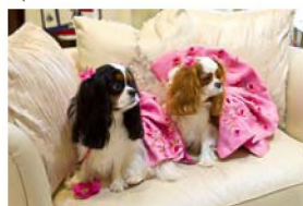
Top Dog Models