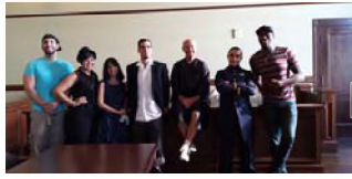
El Mago Cast and Crew