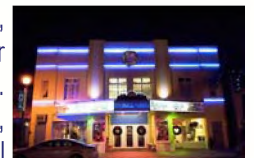
Lake Worth Playhouse

Filmmakers will be able to network with industry directors, filmmakers, actors, writers, and producers at the filmmaker reception on September 27. Then the annual awards ceremony will be held on September 28. Awards will be given for Best Feature, Best Documentary, Best Short, Best Music Video, Best Student Film, and more. Free workshops will also be held on topics such as acting, screenwriting, casting, and more.