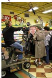
After Midnight filming at a market in Delray Beach

Filming for After Midnight began in Delray Beach last month, and will wrap up this month. The Lion's Kill/Brave Man Media film is a low-budget production and is the first feature-length film for the media group. It hopes to feature this movie, which has been in the works for 18 months, on Netflix. The crew has filmed at many locations including 3rd & 3rd Restaurant in Delray Beach, the Delray Beach Artists Warehouse, the Oscar Magnuson House in Boynton Beach, and many other locations.