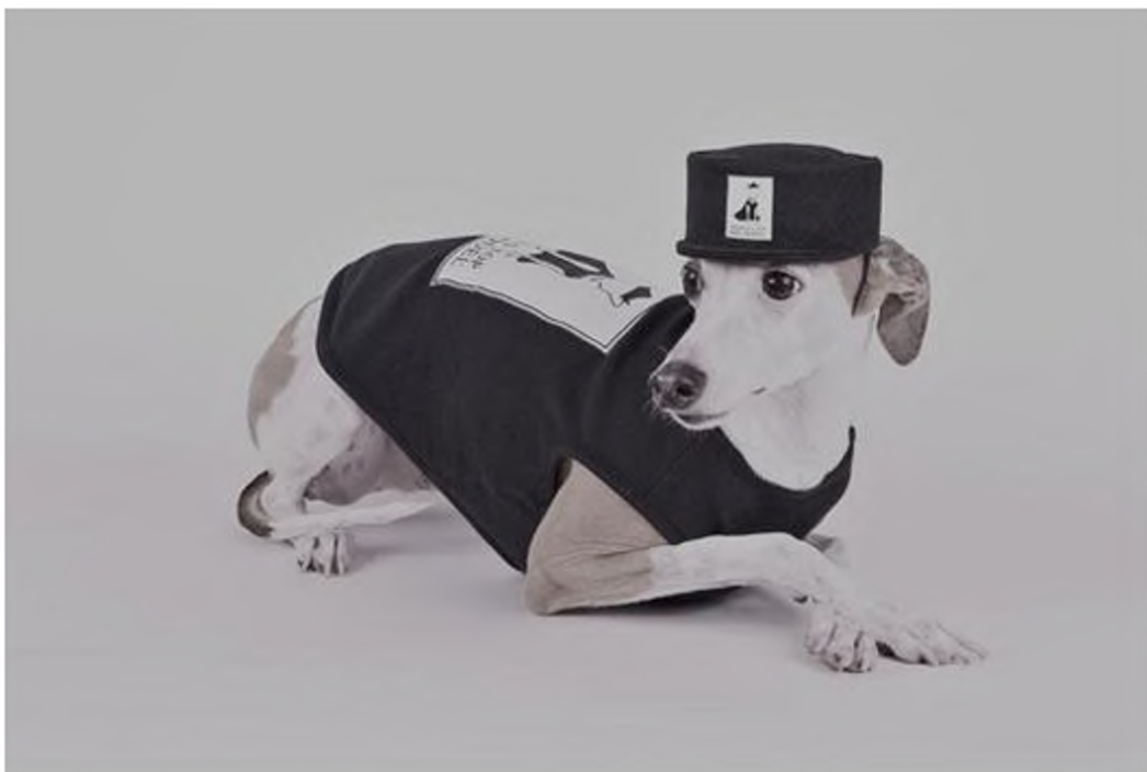
America's Top Dog Model

America's Top Dog Model, a pet lifestyle brand based in Boca Raton, Fla., has begun accepting nominations for its annual competition that recognizes "dogs that make a difference in people's lives." This year's contest is inspired by the vintage style of America's most dramatic and elegant eras, officials said in a statement.